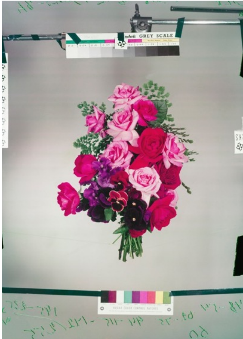
Flowers 1 , 1950s Digital C-type print 43 cm x 60 cm