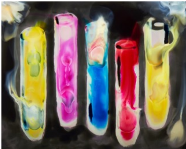
Test Tubes 2, 2015 40 x 50 cm Archival pigment print