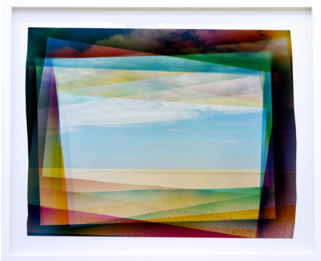
Parralax, 2017 Analog C-type print 93,5 x 114,5 cm (framed) Unique