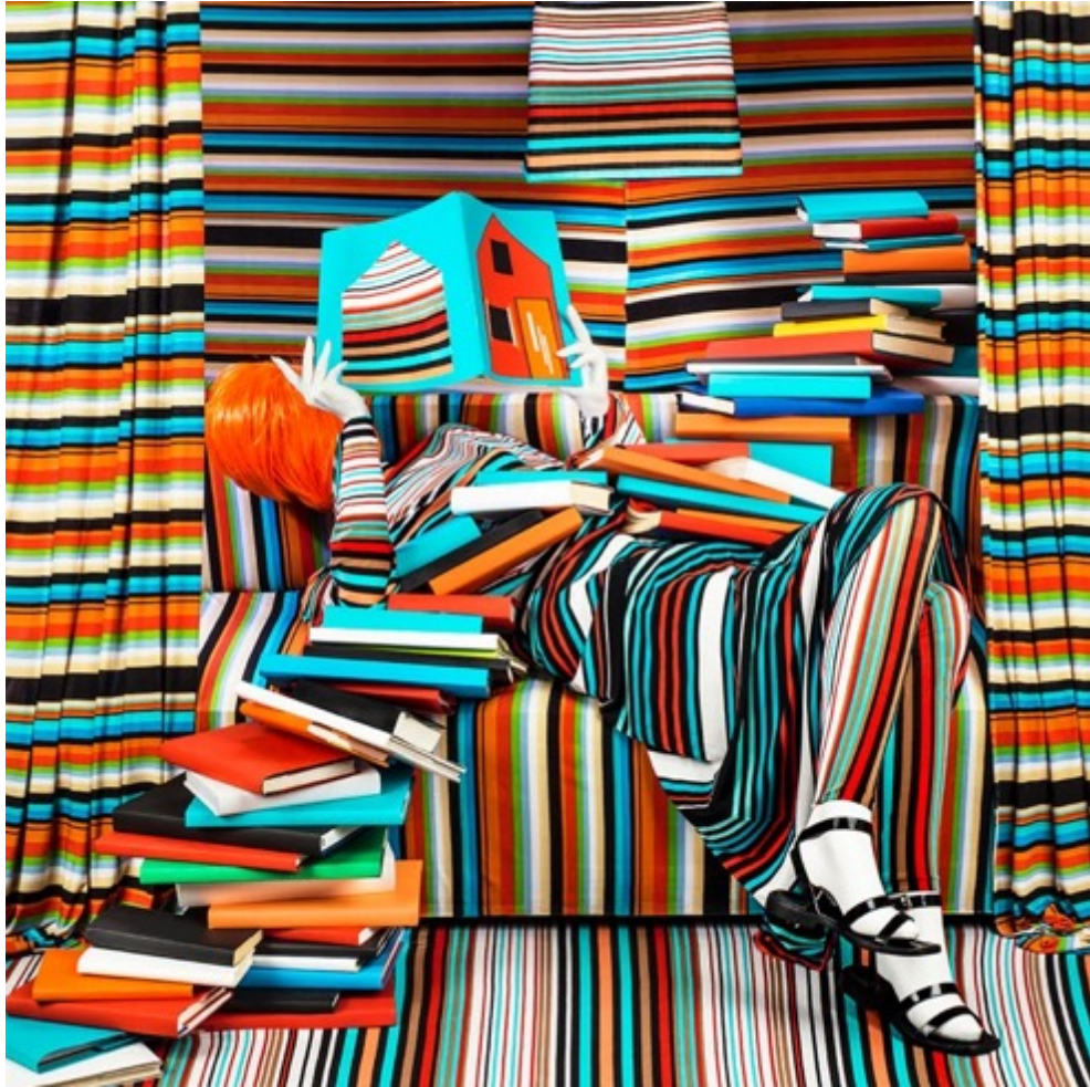
Striped Books: engrossed in her reading, the books coloured her life, 2018 From the series Anonymous Women: Demise Digital print 55 x 55 cm