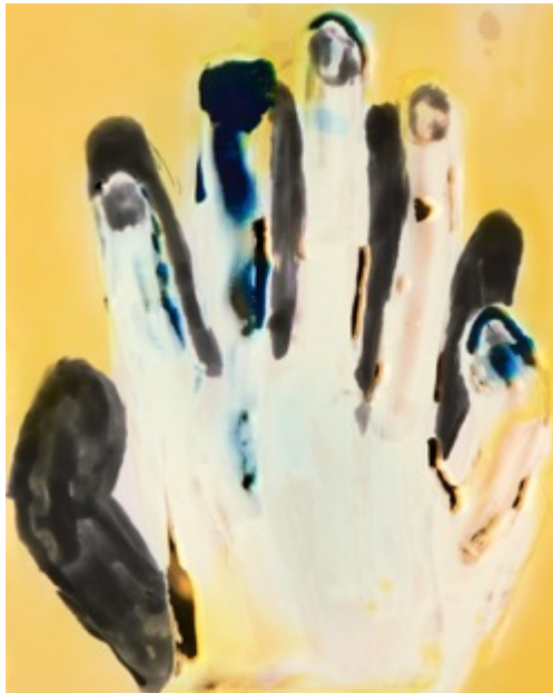
Hand, 2015 30 x 25 cm Archival pigment print