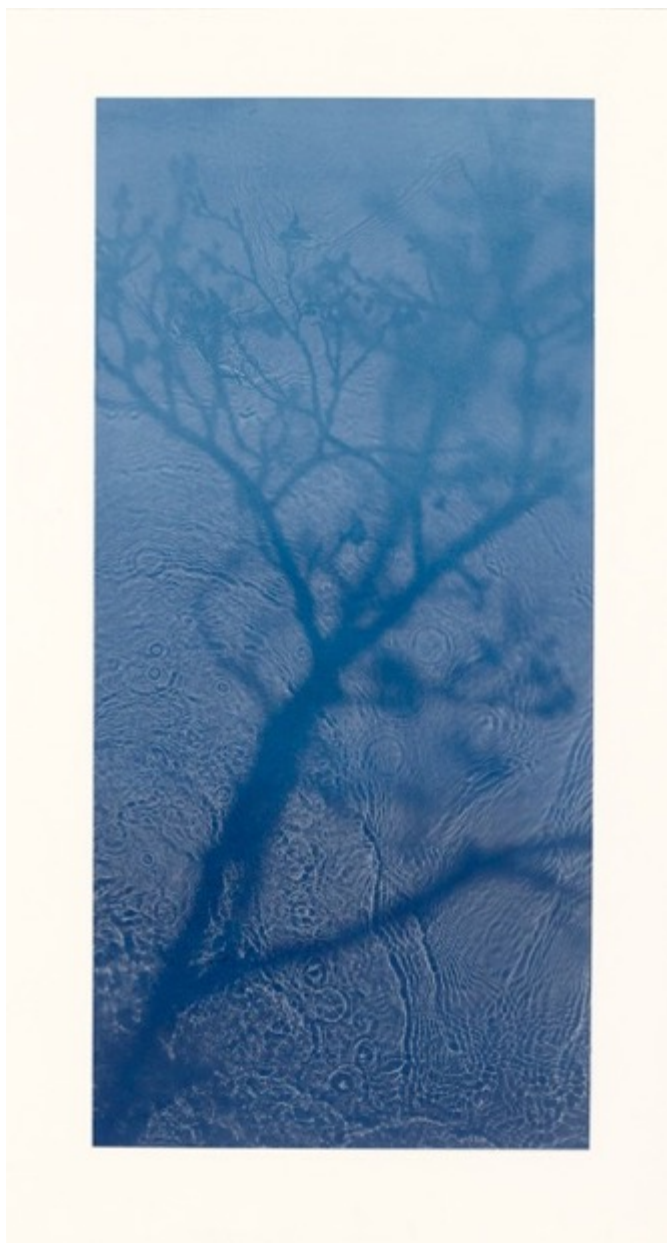
Willow, 2018 Polymer photogravure (2018) 61 X 29 cm