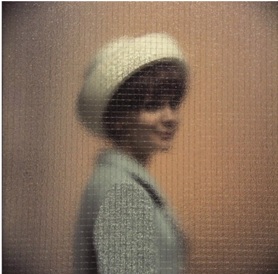
Woman behind glass , c. 1958 Digital C-type print 60 cm x 60 cm