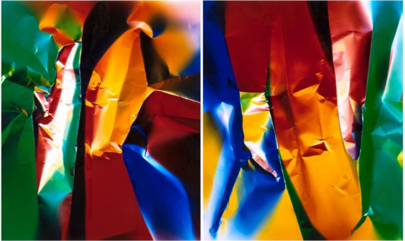
Untitled #3, 2017 From Dings and Shadows series Colour photograms Signed and dated on verso by the artist Two panels 60 x 50 cm each (60 x 120 cm diptych) Unique