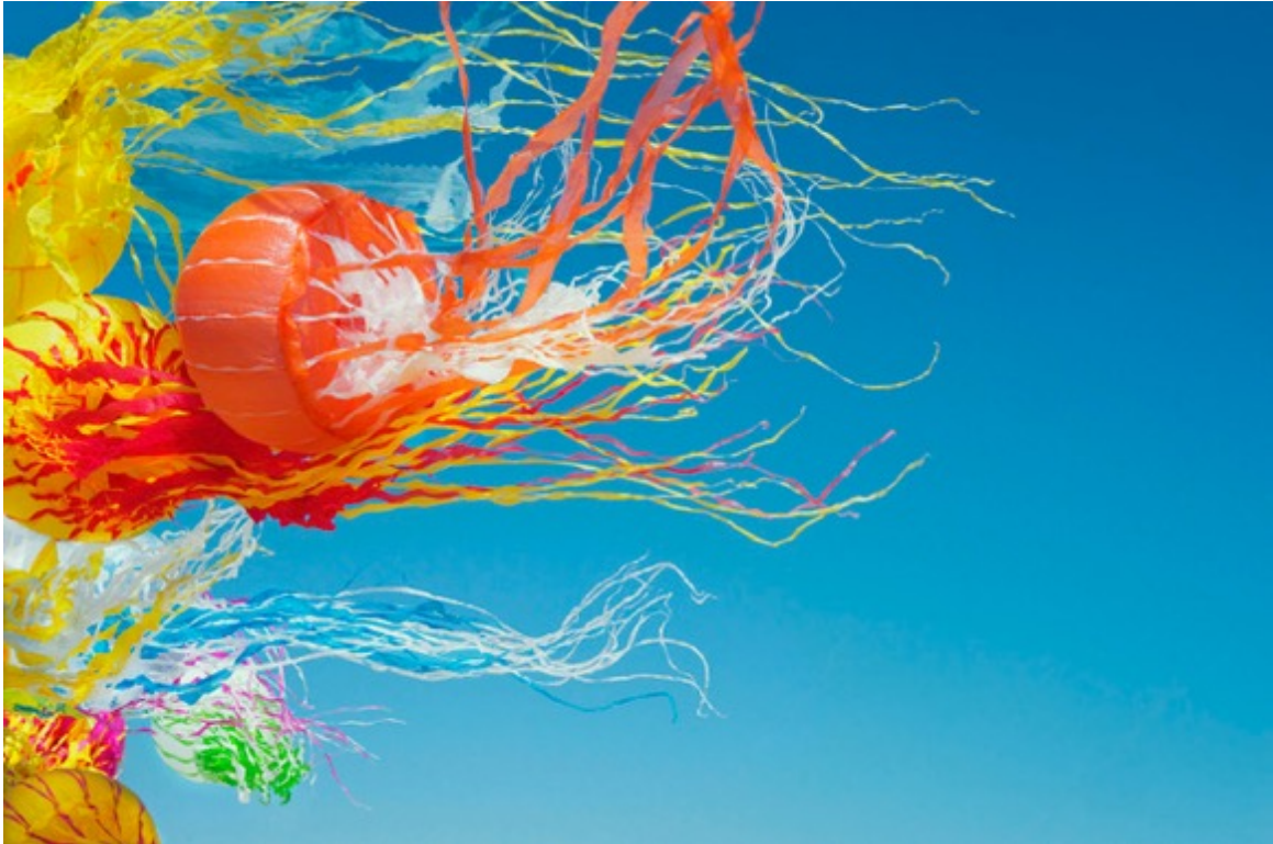
Medusae, 2018 From Heavenly Creatures series Pigment print 85 x 55 cm / 34" x 22"