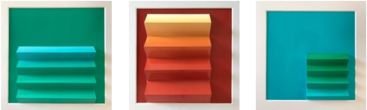
Altered Plane #3, Altered Plane #5, Altered Plane #1, 2018 From the Lightfalls series C-Type Luminograms Signed and dated on verso by the artist Three Cameraless Photographs, cut and folded 20 x 22 cm / 36 x 36 cm framed Unique