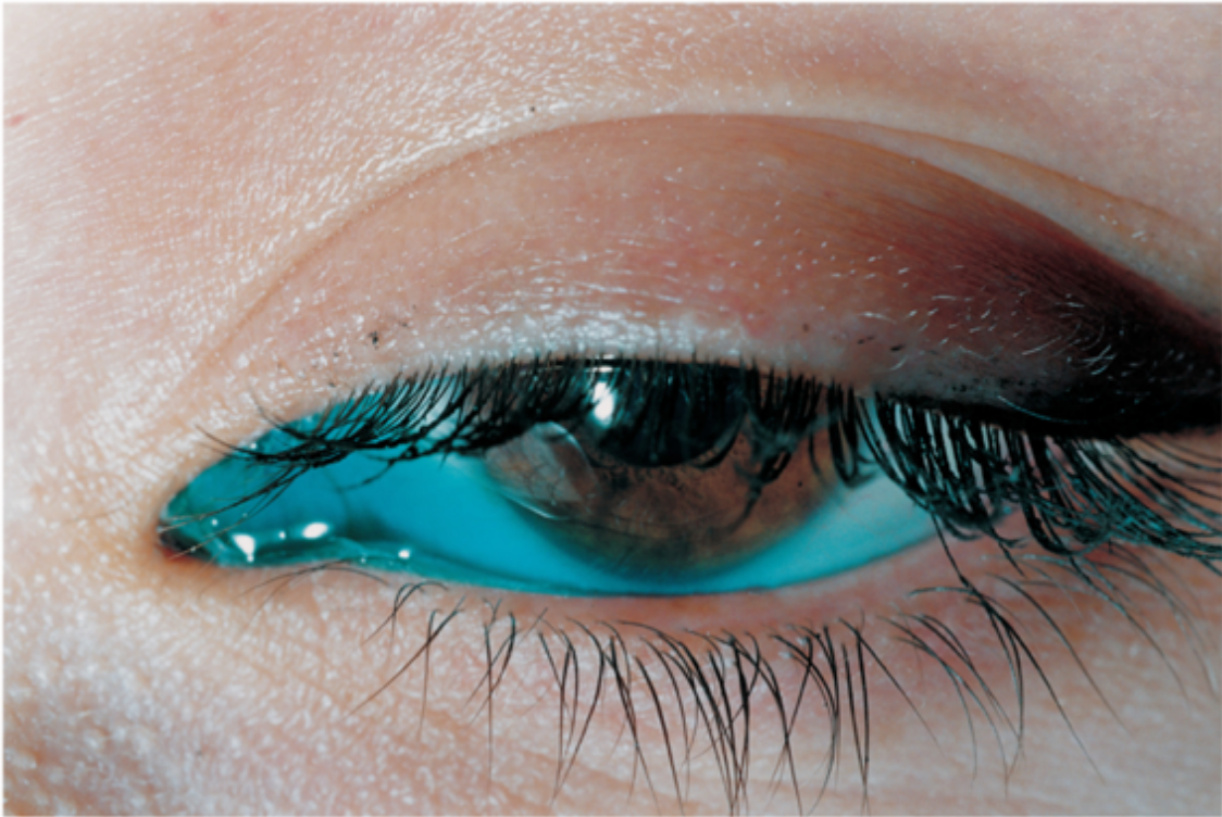
Eye, 1996 From series and book Closer C-print 50 x 60 cm