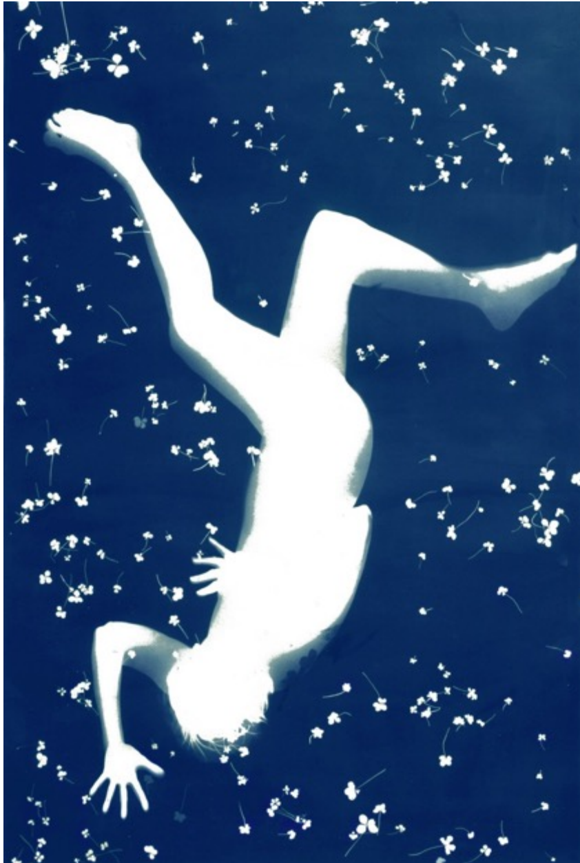
Falling Angel #11 Photogram in cyanotype 220 x 140 cm Unique